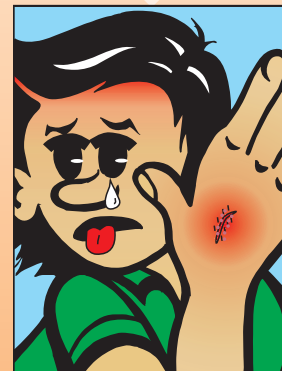
He tamaiti e kino haere nei te ero