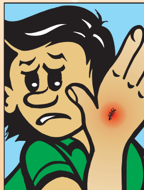
He tamaiti e moroiti nei te ero