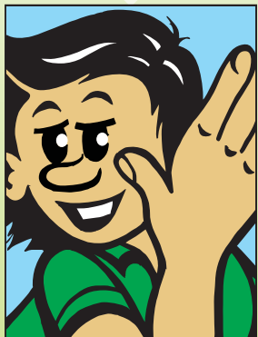
He tamaiti ora

Uhia ngā mamae me ngā motunga ki te tākai * Kia mā tonu atu te kiri