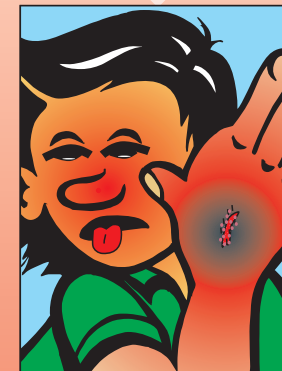
He tamaiti e pāngia ana ki te ero kikino